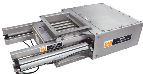
Eriez Automatic Easy-To-Clean Magnetic Grate-In-Housing

The simplest versions incorporate a single-layer magnetic grid and are used inside a hopper so that raw materials must pass through the grates as material feeds from the hopper. Multiple row units improve separation effectiveness. Grate-housing designs may include a standard grate that can be removed from the housing for manual cleaning. An easy-to-clean grate design enables push/pull operation to strip accumulated tramp metal from the grates without physically handling the magnet. Eriez also offers an Automatic Easy-To-Clean model which uses a set of pneumatic cylinders to automatically discharge tramp metal from the magnetic grates with the push of a button or timer control.