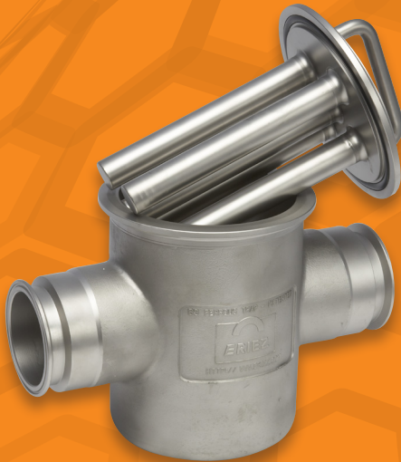
Eriez Model B Magnetic Traps

People all around the world consider their pets as a cherished part of the family. That is why it should be no surprise that pet food ingredients undergo the same stringent quality checks as food manufactured for humans. Many of the world's largest pet food producers rely on Eriez magnetic separation equipment to ensure their end-product is free of metal contamination which could be extremely harmful to pets.