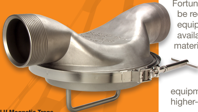
Eriez Model U Magnetic Traps