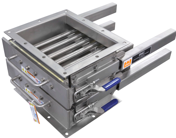
Eriez Manual Easy-To-Clean Magnetic Grate-In-Housing